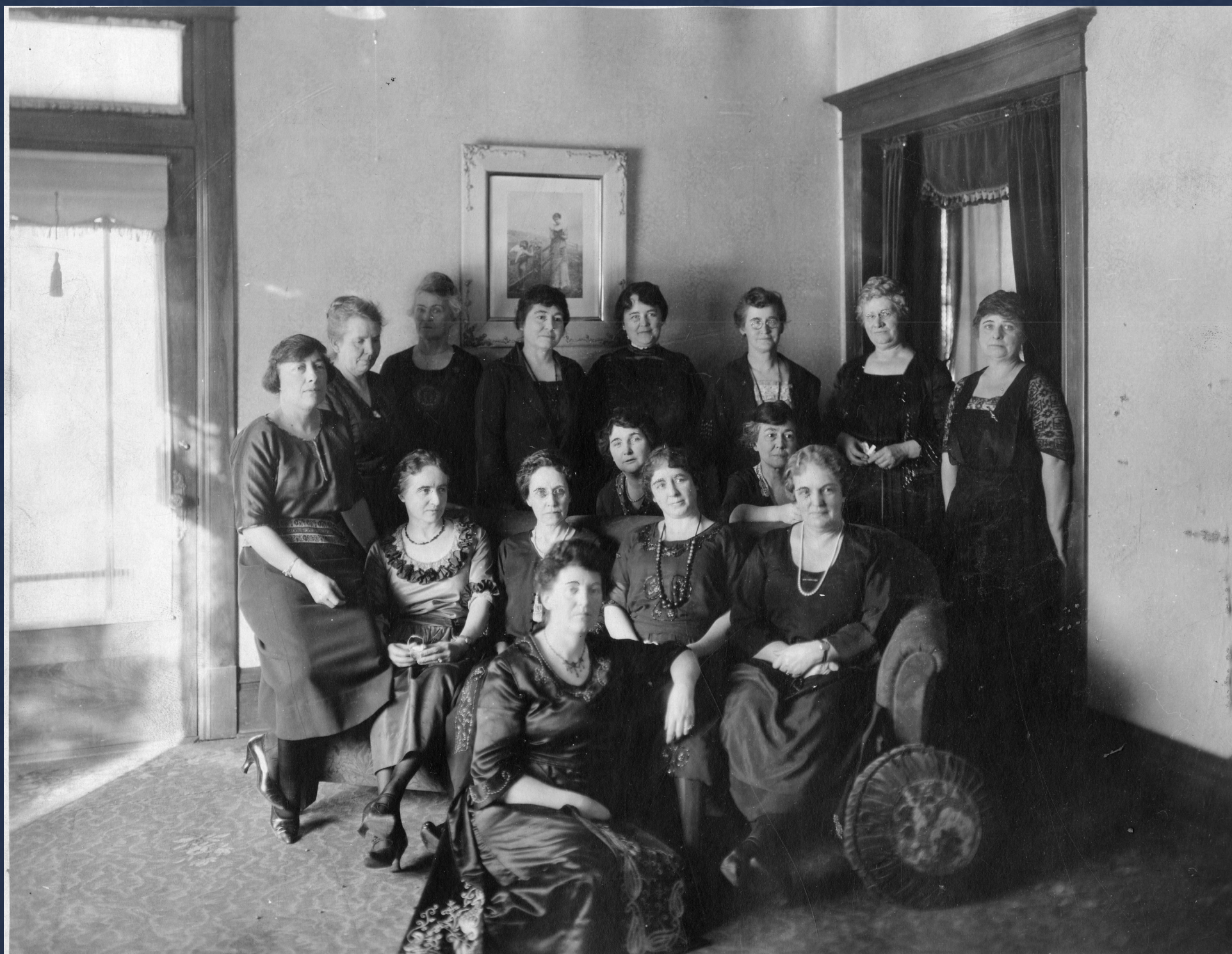
Club members gathered in 1916 to celebrate the founding of the Ladies Literary Club of Ogden.