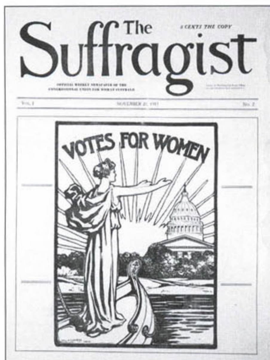
Figure 3. Volume 1 of the Suffragist newspaper.

specific needs of students and the curriculum.