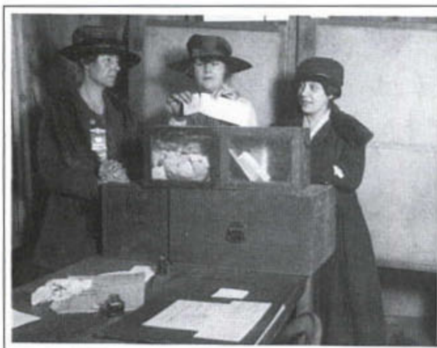
Figure 5. Three suffragists casting votes in New York City.

The Votes for Women: The Struggle for Women's Suffrage < https://bit.ly/1q2bH7o > project includes selected images across digital collections, including portraits, cartoons, ephemera, and more. For instance, Three Suffragists < https://bit.ly/2nbprQY > is a photo that would be useful in a class discussion. What were these women thinking as they cast their first vote?