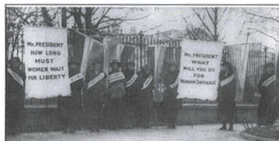
Figure 4. Silent Sentinels: The first picket line.

The Library of Congress houses a wide range of digitized documents and other resources connected to the 19th Amendment and women's suffrage. For instance, a 1917 photo from the photo collection shows the Silent Sentinels < https://bit.ly/2B18UH1 > picketing outside the White House in Washington, DC. Organized by Alice Paul and the National Woman's Party, the suffragists protested peacefully 6 days a week between January 1917 and June 1919 when the 19th Amendment was passed. Each photo has a story to tell. Use these images to talk with stu-