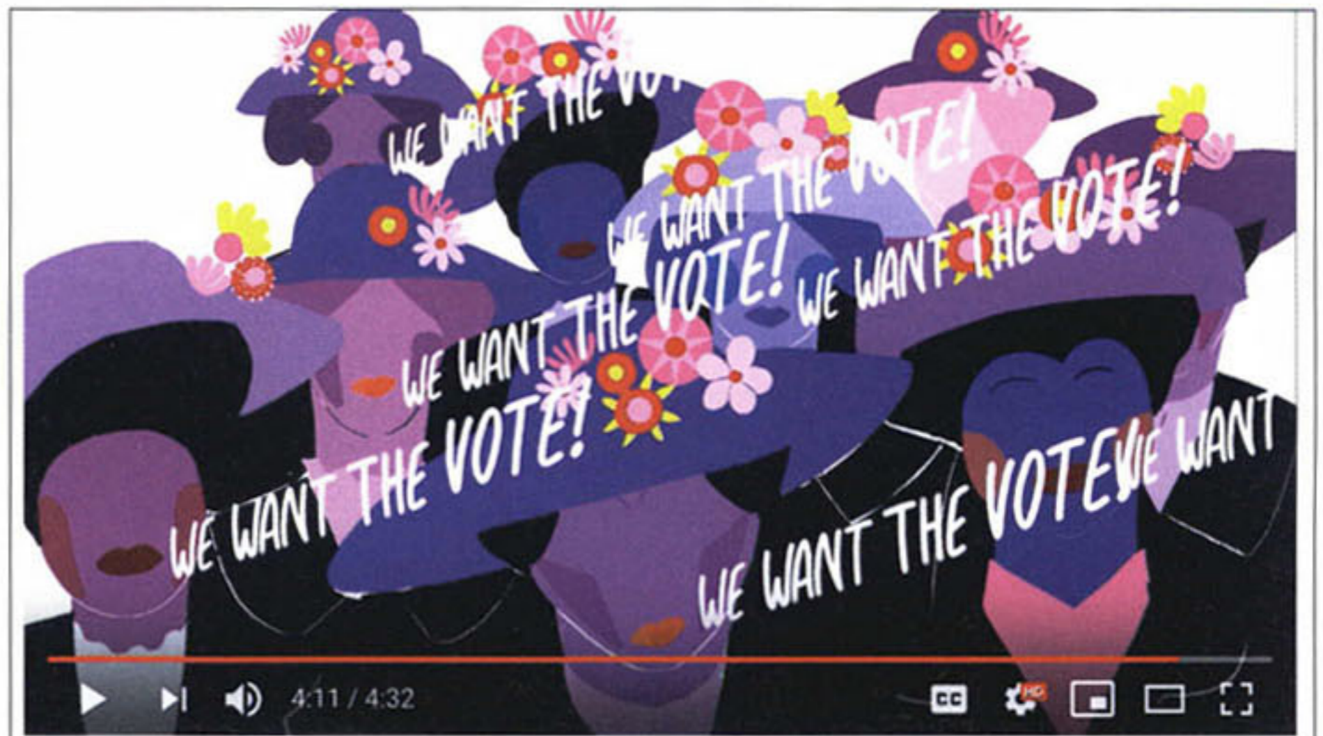
27: The Most Perfect Album | Dolly Parton | 19th Amendment (MUSIC VIDEO)

The Rutgers Center for American Women and Politics < https://bit.ly/2RGv0Fj > features a lesson model