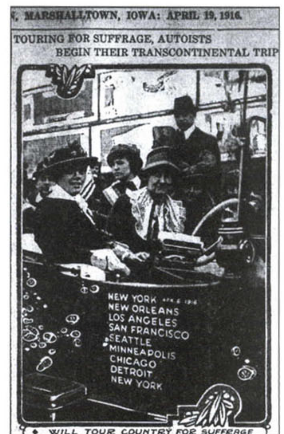
Figure 8. Newspaper article, 1916

A number of curriculum-related materials are available through the Library of Congress. The Primary Source Sets: Women's Suffrage < https://bit.ly/2T6uiBH > page contains a teacher's guide, a student discovery set, an analysis tool, and primary sources. The Classroom Connections: Votes for Women < https://bit.ly/2RCSgaO > project provides suggestions for using primary sources in teaching and learning. Other lesson plans include: