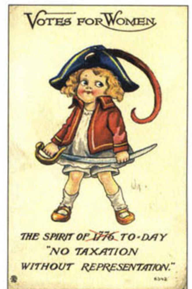
Figure 2. Woman Suffrage Postcard. National Museum of American History.

Discovering American Women's History Online < https://bit.ly/2sG9cOI > provides links to nearly 40 digital collections on women's history and specifically suffrage. Use this resource to curate a set of materials that best fit the