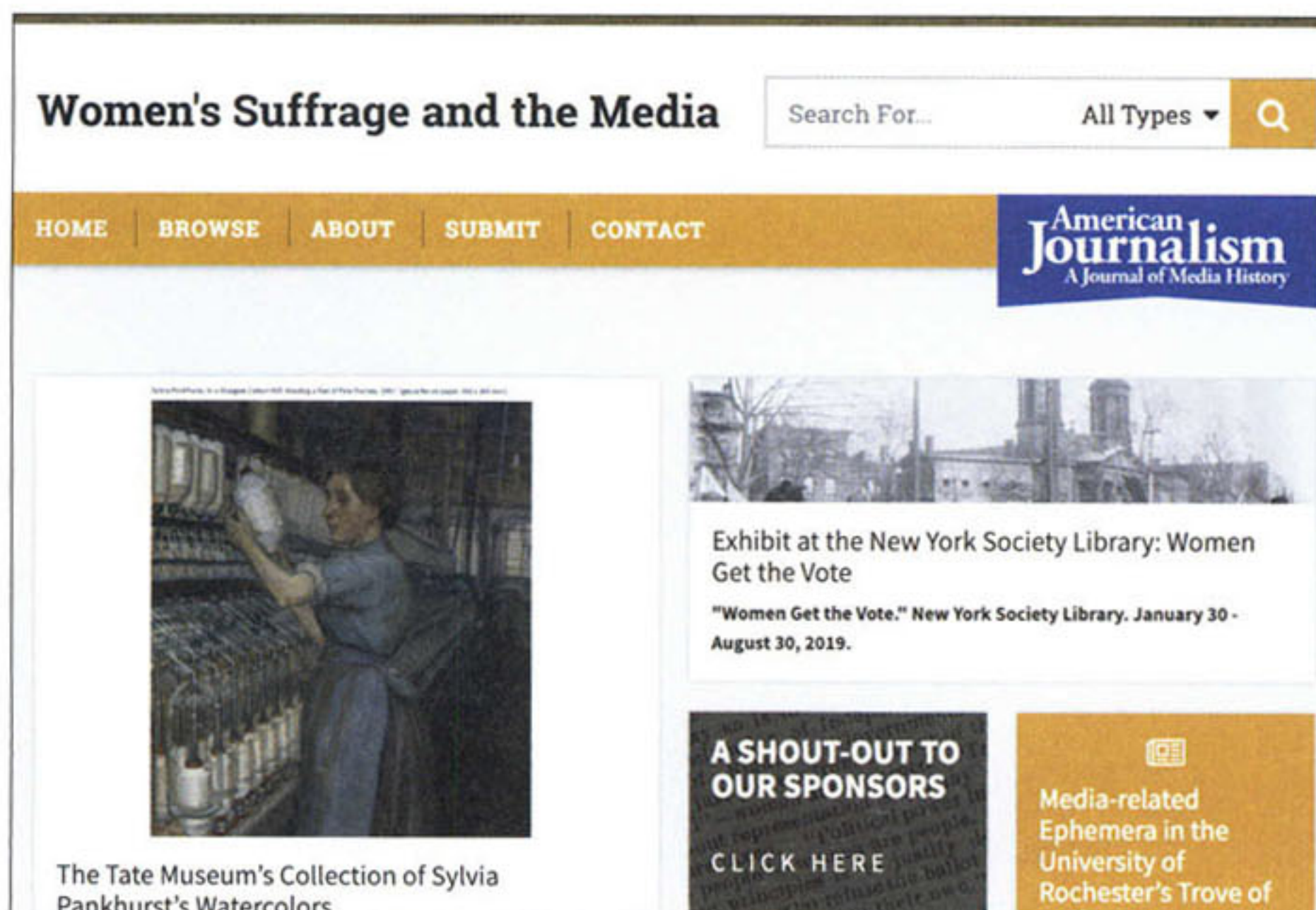
Figure 7. Women's Suffrage and the Media website

The Women's Suffrage and the Media < https://bit.ly/2rlqRsK >