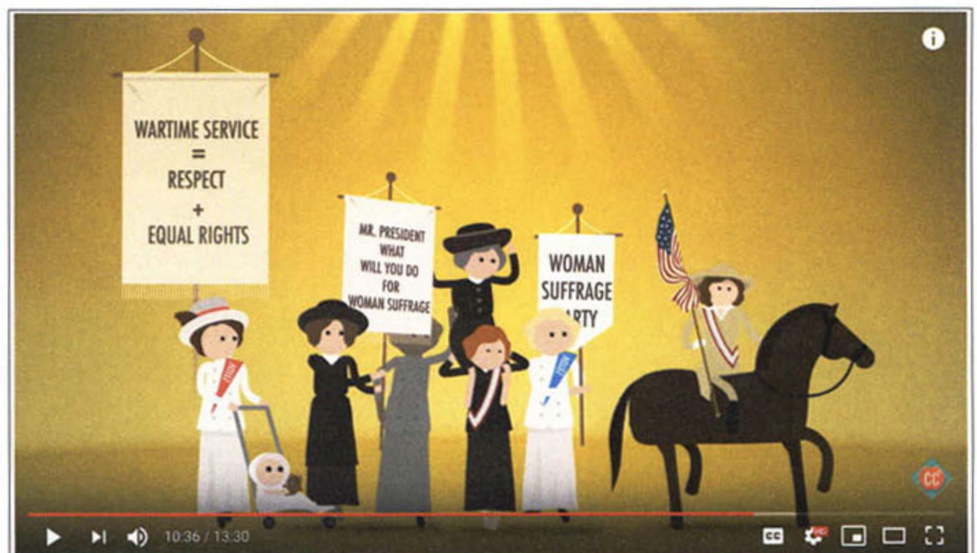
Women's Suffrage: Crash Course US History #31